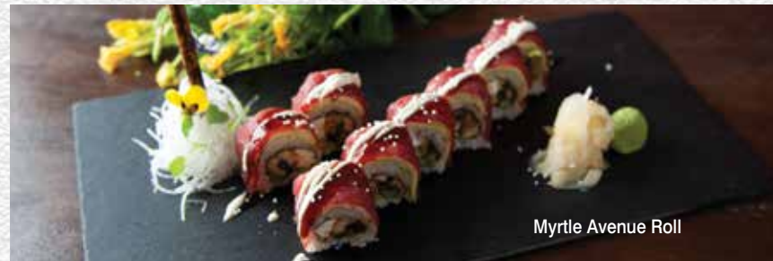
Myrtle Avenue Roll