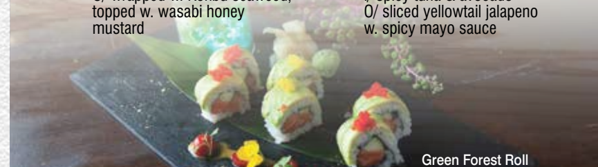
Green Forest Roll