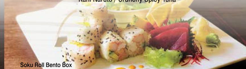
Soku Roll Bento Box